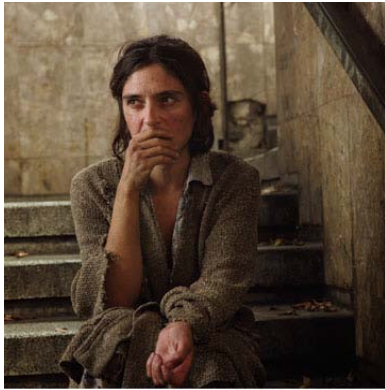
Adi Nes, Hagar , 2006.