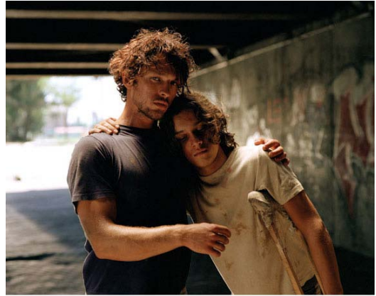
Adi Nes, David and Jonathan , 2006.