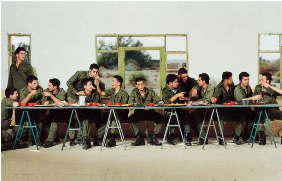
Adi Nes, Untitled (The Last Supper) , 1999.